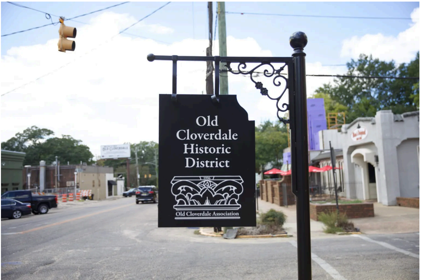
Cloverdale neighborhood in Montgomery.

The storefront will be located along East Fairview Avenue across from the Capri Theatre.