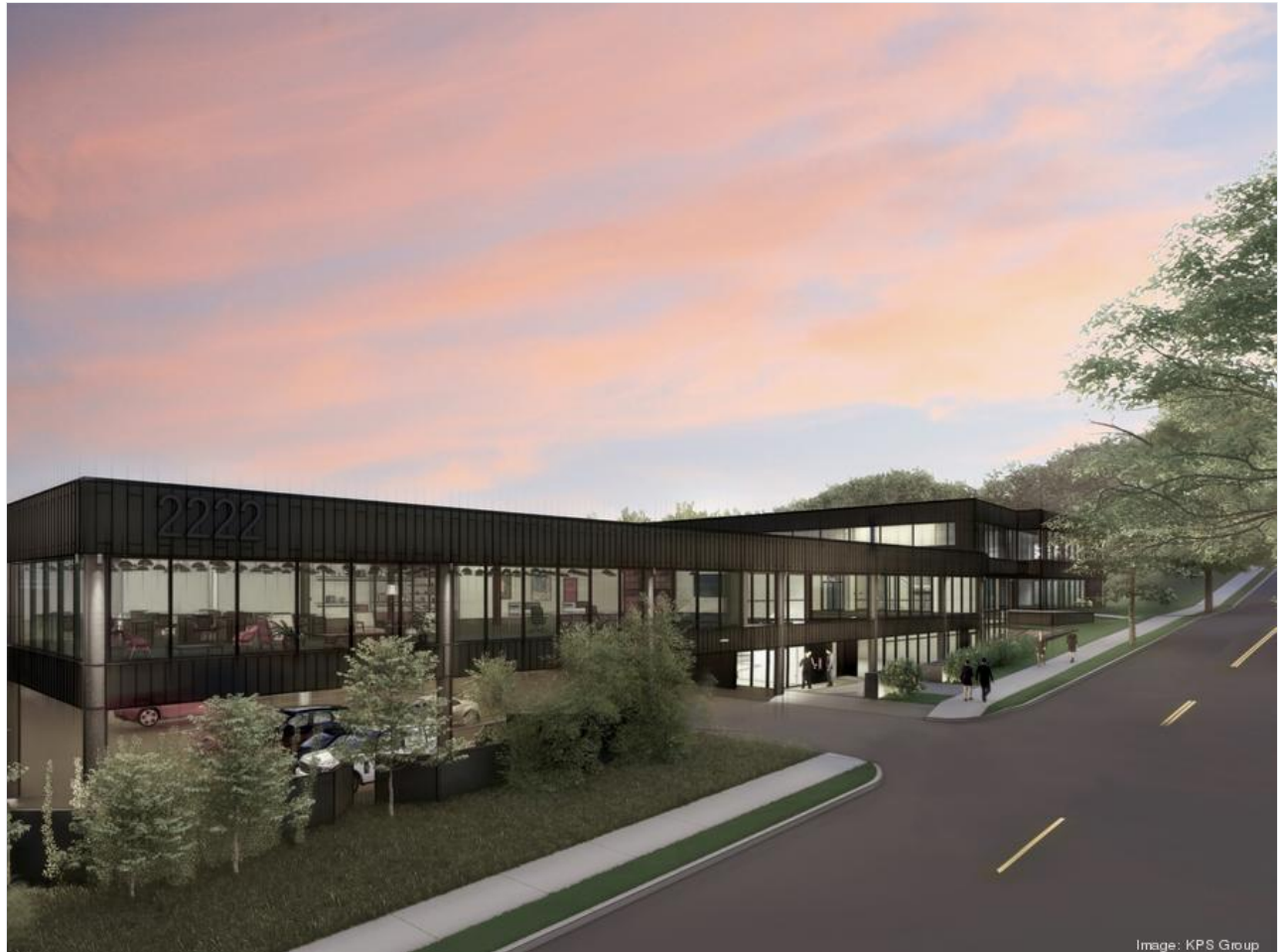
Shipshape will be an anchor tenant at 2222 Arlington Ave. office building.